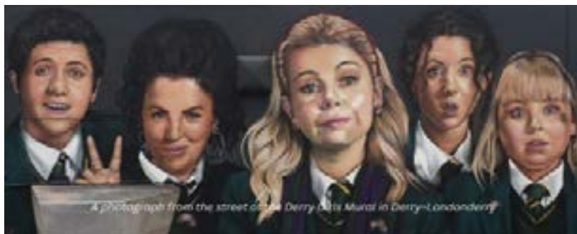
A photograph from the street of the Derry Girls Mural in Derry-Londonderry

Its annual festival platforms include the globally acclaimed Happy Days Enniskillen International Beckett Festival and the Lughnasa FrielFest & A Wilde Weekend which spring from the work of Irish dramatists Brian Friel and Oscar Wilde.